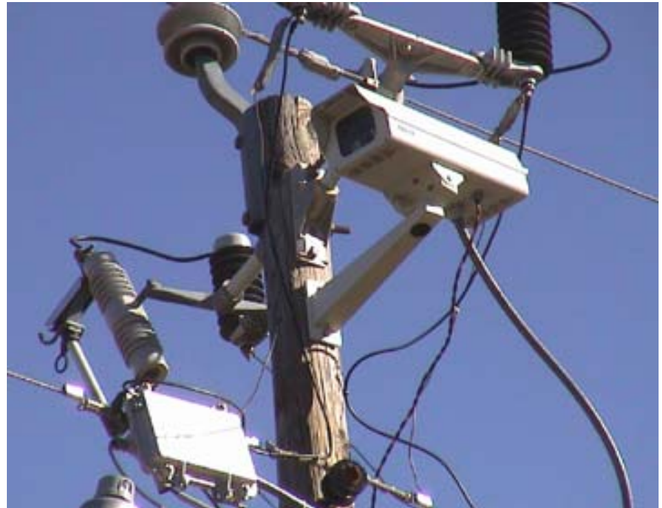
BPL Surveillance & Security System